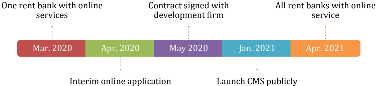
Figure 3: Client Management System (CMS) Development

BC Rent Bank now has a CMS that is popular with both renters and service providers, and will benefit both key stakeholders for years to come.